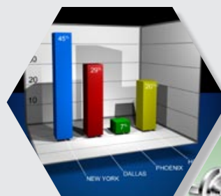
3D Bar Chart