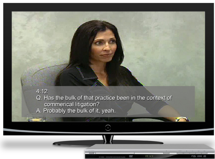
DepoView DVD - Play Video

Using your DVD control, turn subtitles on or off when reviewing or presenting video.